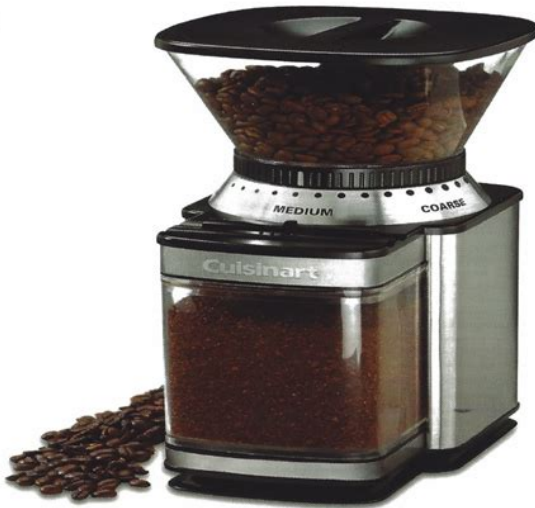
Supreme Grind® Automatic Burr Mill